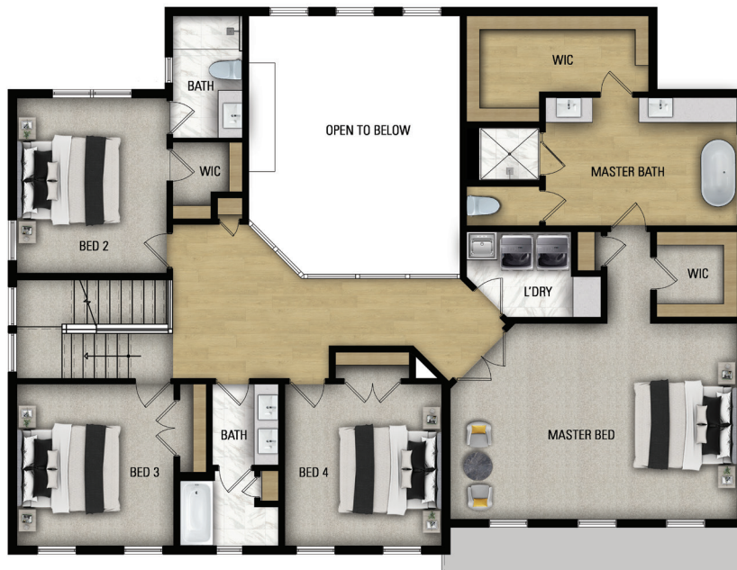
SECOND FLOOR PLAN ELEVATION #1