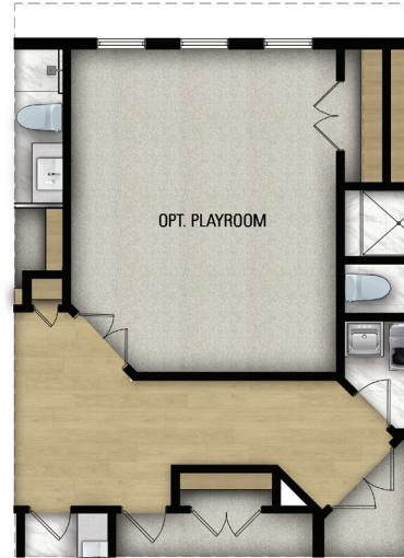
OPT. SECOND FLOOR PLAYROOM PARTIAL PLAN