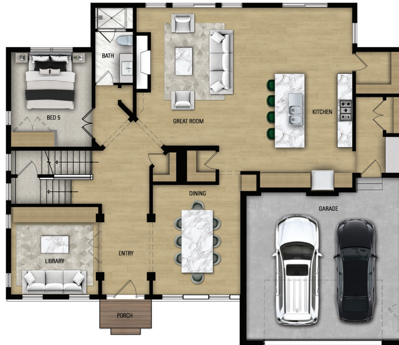
FIRST FLOOR PLAN ELEVATION #1