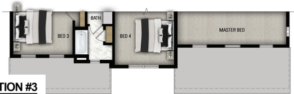
ELEVATION #3 PARTIAL PLAN