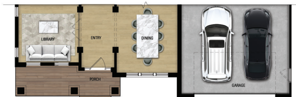
ELEVATION #2 PARTIAL PLAN