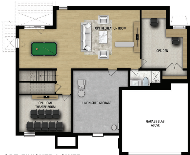
OPT. FINISHED LOWER LEVEL