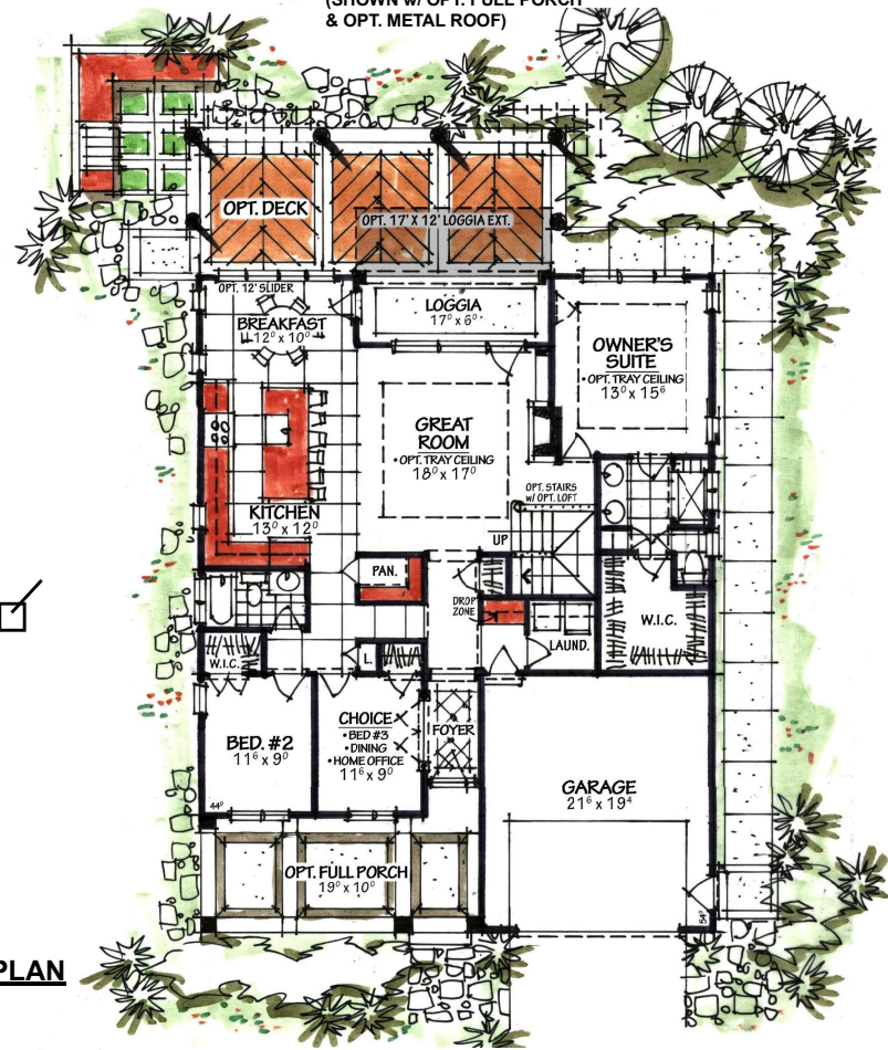
FIRST FLOOR PLAN (1,731 S.F.)