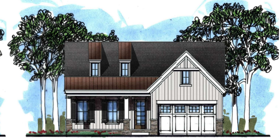
FRONT ELEVATION 'C' (SHOWN w/ OPT. FULL PORCH & OPT. METAL ROOF)