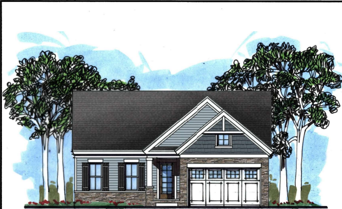
FRONT ELEVATION 'A'