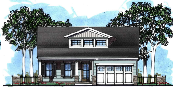
FRONT ELEVATION 'B' (SHOWN w/ OPT. FULL PORCH)